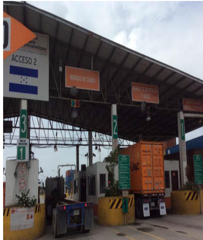
Long delays at check points