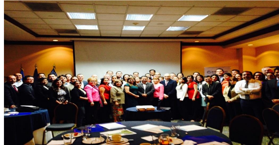
Central American Regional Workshop, San Salvador, El Salvador, September 2015

OECS Organization of Eastern Caribbean States (Grenada, St Kitts, Dominica, St Lucia)